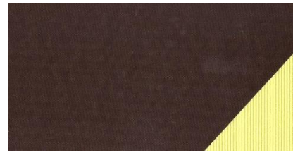
YELLOW RELEASE LINER (CORRUGATED)

FIBERLAM CS10AD is glass fabric coated with PTFE (Teflon), both side laminated with cast PTFE multilayer film then one side coated with high temperature resistant, silicone pressure sensitive adhesive.