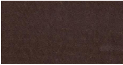
BRONZE PTFE CAST FILM LAMINATED SIDE FRONT