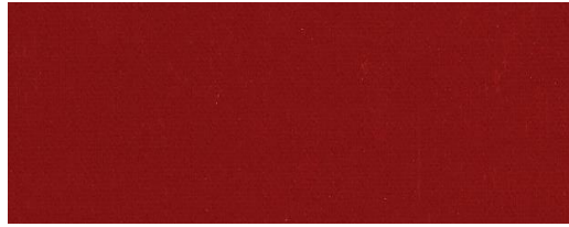
PTFE COATED SIDE (RED)